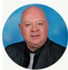
Child Protection Officer