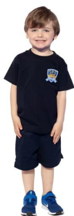
Navy blue t-shirt (with or without logo)