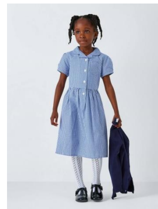
Blue and white checked dress set (during the summer months)