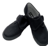
Black school shoes or plimsolls

Our school has a duty to make sure that the uniform we require is affordable, in line with statutory guidance from the Department for Education (DfE) on the cost of school uniform. In order to support all, parents may choose where they would like to buy their uniform items from. The only item of uniform which requires the school logo is the navy school sweatshirt. If you would like to purchase other items of branded uniform, please visit our school uniform supplier, 'Uniform4kids'.