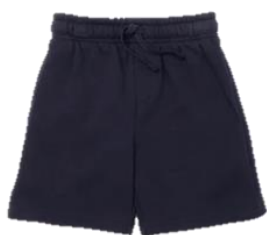
Navy bottoms e.g. shorts or tracksuit trousers/leggings