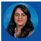
Designated Safeguarding Lead