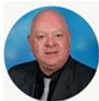
Child Protection Officer